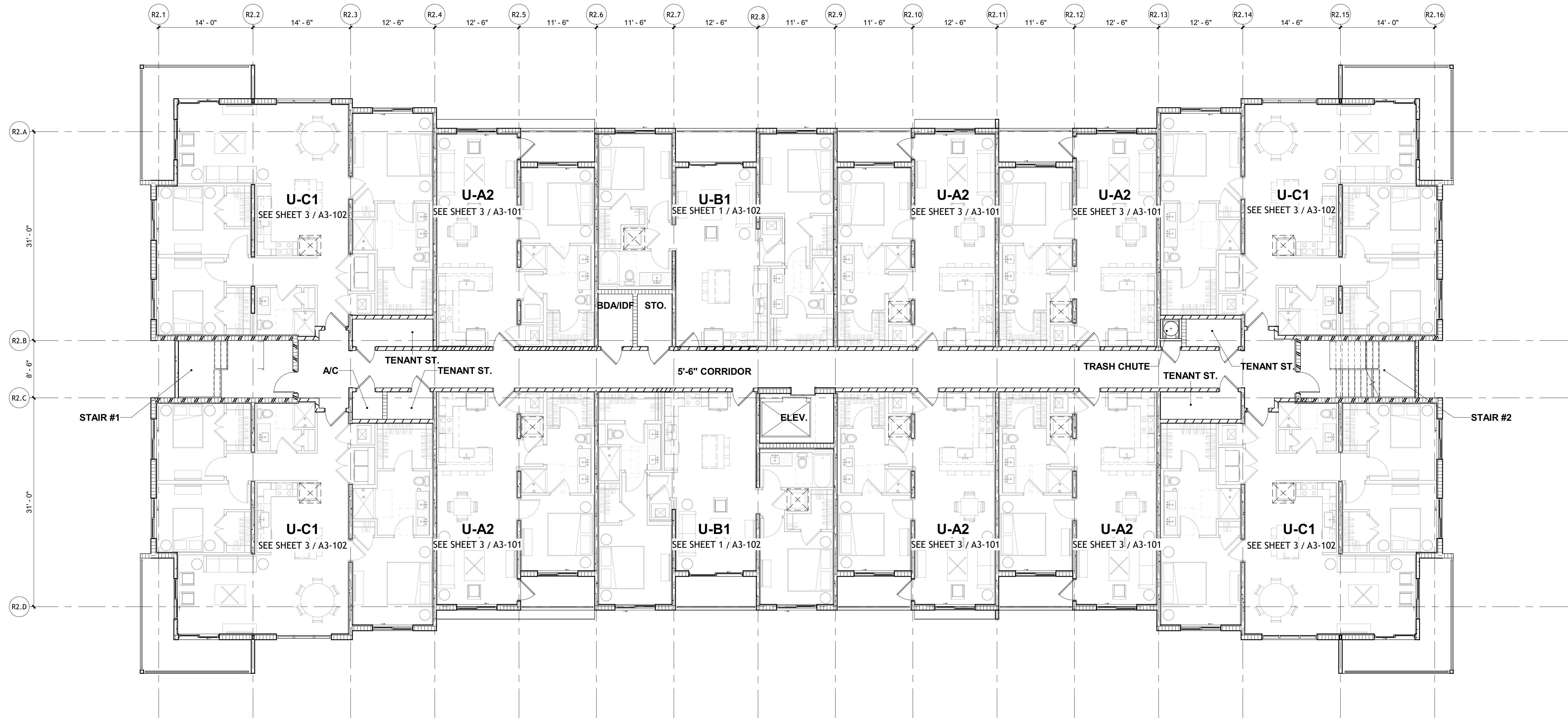
1 FLOOR PLAN BUILDING #1, #6 - LEVEL 5